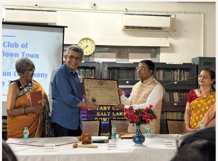
Installation Ceremony – Handing over the club charter to RY25-26 President by IPP – 11th Jul'25